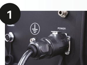
1 200-240Vac power supply