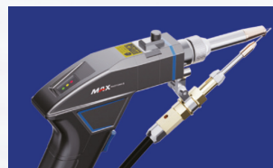
Welding torch with wire feeder

Equipped with a revolutionary laser optic design, our welding torch is impressively lightweight at just 680g (1.5 pounds) . Its optical design and QCS output head are seamlessly integrated, providing high transmission efficiency and heat output. Ergonomically crafted for user comfort, the torch is easy to operate. We've also included a built-in wobble function with a multi-point interlock system, allowing operators to work safely all day while consistently delivering high-quality welds.