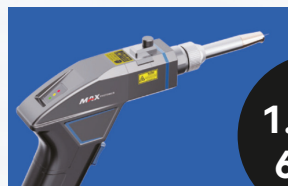
Handheld welding torch