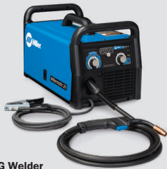
MIG Welder 907614 $1,179 MSP

Millermatic® 211 $100 REBATE $1,079 AFTER REBATE PRICE