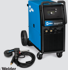
TIG Welder 951684 $2,839 MSP

Syncrowave® 210 $200 REBATE $2,639 AFTER REBATE PRICE