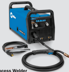
Multiprocess Welder 907693 $1,449 MSP

Multimatic™ 215 $100 REBATE $1,349 AFTER REBATE PRICE