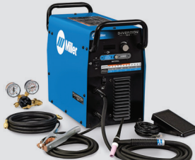
TIG Welder 907627 $2,139 MSP

Diversion™ 180 $200 REBATE $1,939 AFTER REBATE PRICE