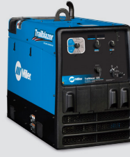
Welder/Generator 907510001 $5,175 MSP

Trailblazer® 325 $300 REBATE $4,875 AFTER REBATE PRICE