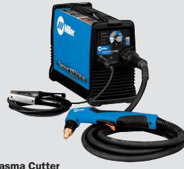
Plasma Cutter 907579 $1,879 MSP

Spectrum® 625 X-TREME™ $100 REBATE $1,779 AFTER REBATE PRICE