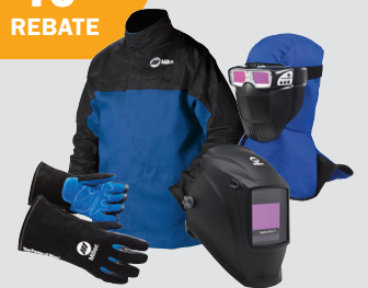
Choose any Miller Digital Elite™ Series helmet or Weld-Mask™ Auto-Darkening Goggles plus a pair of Miller gloves and a Miller welding jacket.

Digital Elite™ or Weld-Mask™ Bundle $40 REBATE