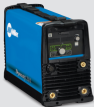
TIG Welder 907685 $3,529 MSP

Dynasty® 210 $200 REBATE $3,329 AFTER REBATE PRICE